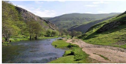
Peak District Hills